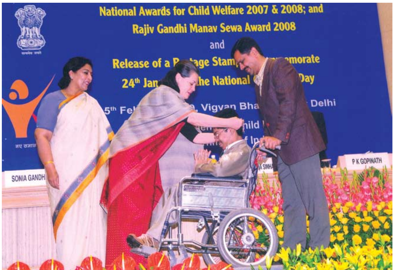
Smt. Sonia Gandhi, Chairperson, UPA Presenting National Child Awards on 05.02.2009 in the presence of Smt. Renuka Chowdhury, Honourable MOS (IC) MWCD