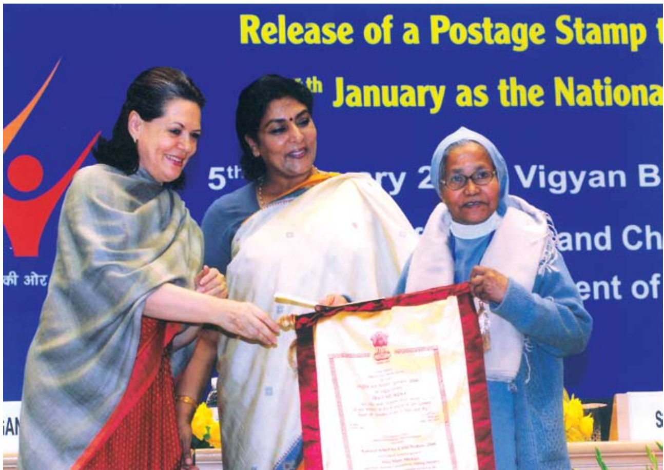
National Award for Child Welfare Presentation Function