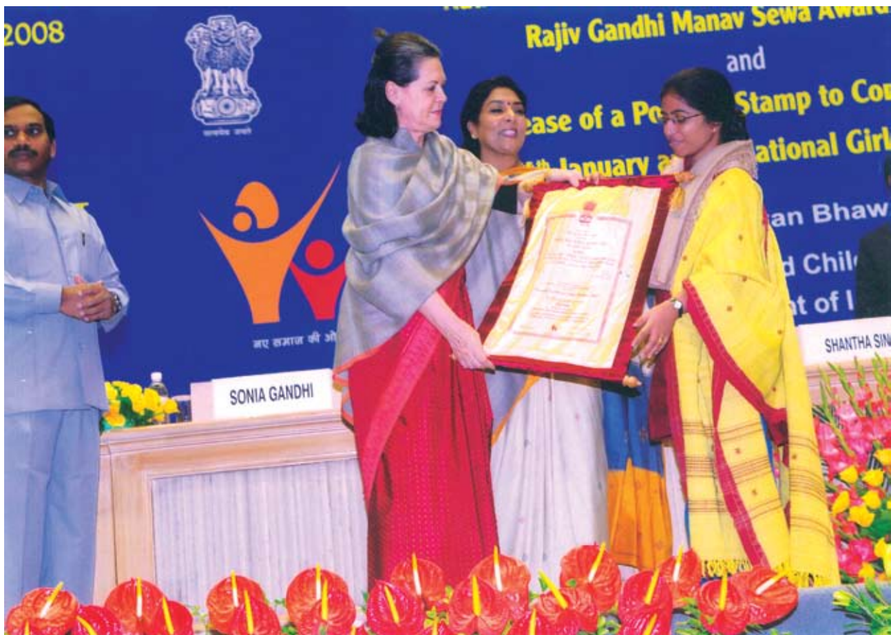
National Award for Child Welfare Presentation Function