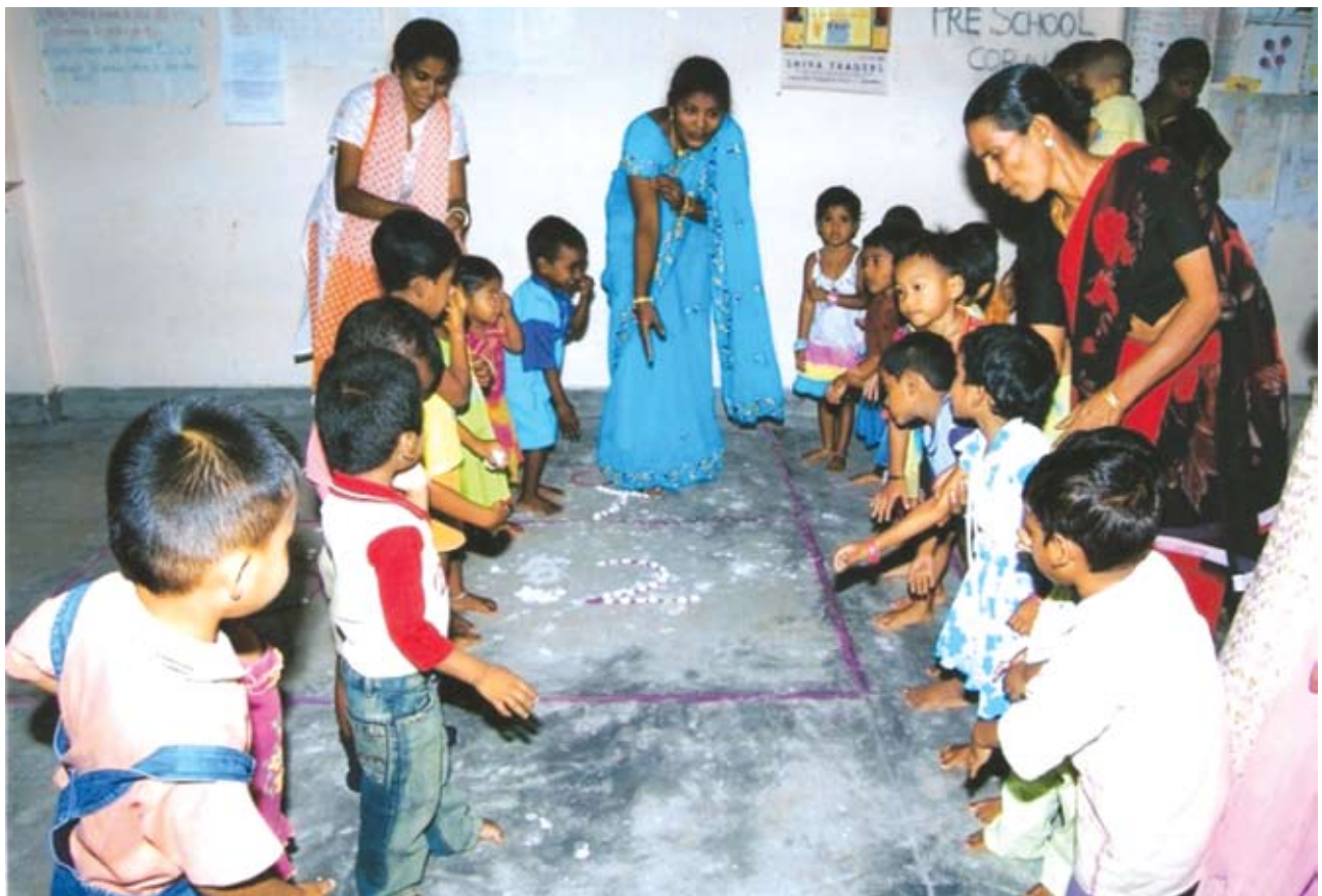
Pre-school Education session in Anganwadi Centre