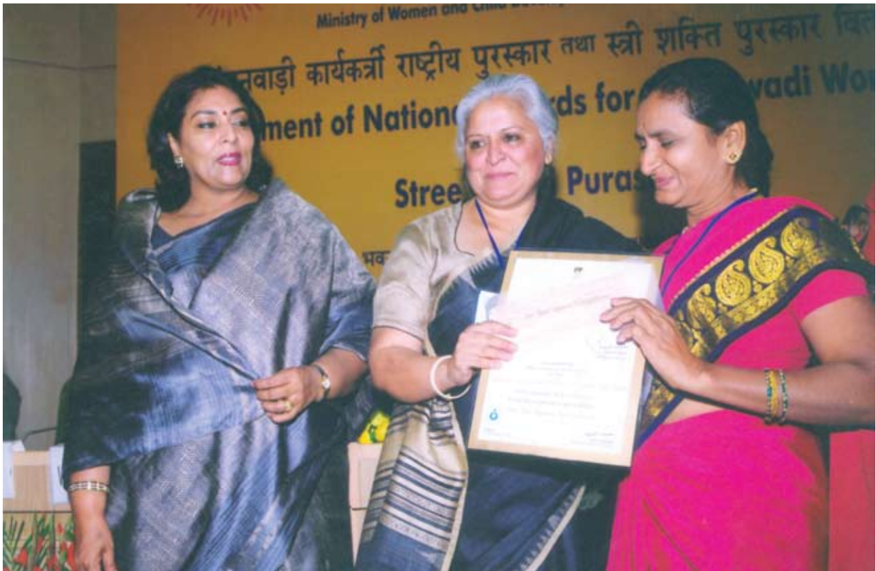
Honourable Minister of Women and Child Development presenting National Award for Anganwadi Workers

3.6 The population norms for setting up of Anganwadi Centres and Mini-Anganwadi centres are as under: