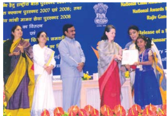
National Child Award presentation Function