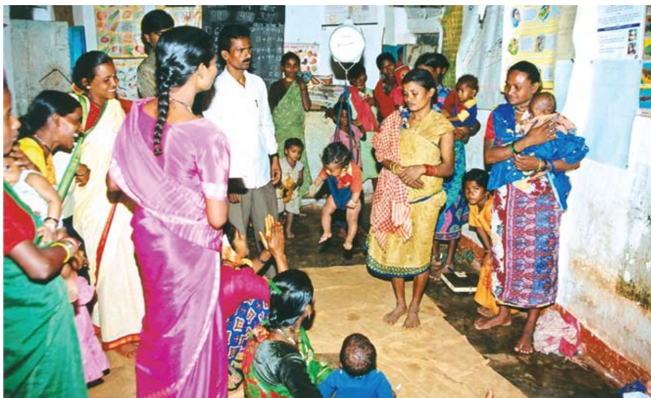
Child Growth Monitoring at Anganwadi Centre