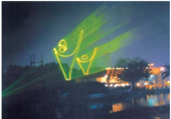
Laser Show during Vatsalya Mela

and informative exhibition at the Pragati Maidan, New Delhi. A number of Self Help Groups set up stalls in the Ministry's pavilion showcasing a wide array of products. An innovative laser show and cultural programmes organised by the Song & Drama Division of Ministry of Information and Broadcasting enthralled visitors to the fair every evening.