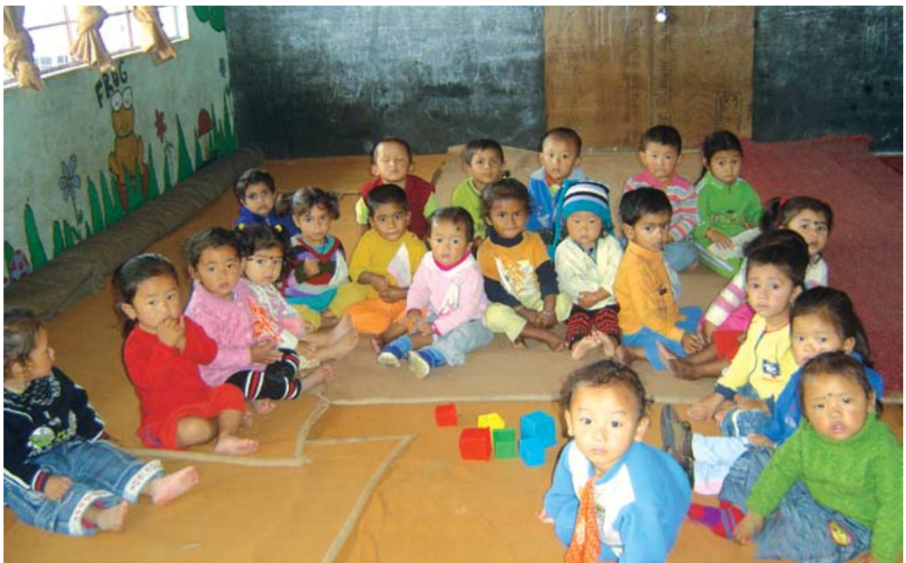
Children attending Pre-school Education session in Anganwadi Centre