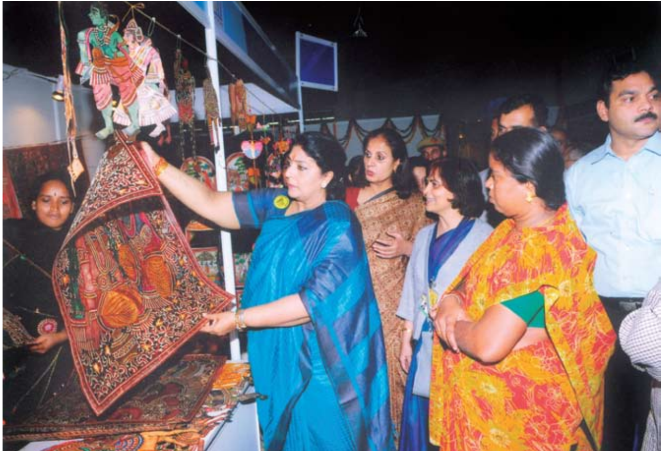
Smt. Renuka Chowdhury, Minister of State (I/C), MWCD viewing a stall in Vatsalya Mela

which was referred to the Department Related Parliamentary Standing Committee. The Group of Minister (GOM) under the Chairmanship of Shri Arjun Singh, Hon'ble Minister of Human Resource Development considered the recommendations of Parliamentary Standing Committee from the Legislative Department on the subject of amendments to the Prevention of Child Marriage Bill, 2004.