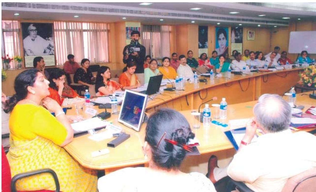
Formulation of Rajiv Gandhi Scheme for Empowerment of Adolescent Girls-National Consultation May, 2008

3.18 Grant- in-aid @ of Rs.1.10 lakh only per block per annum is released to the States / UTs for the implementation of KSY. A sum of Rs. 52.63 crore have been released to States / UTs under KSY in 2008-09. State-wise details of