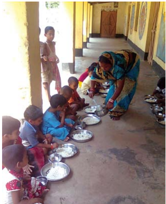
Providing Supplementary nutrition in Anganwadi Centre